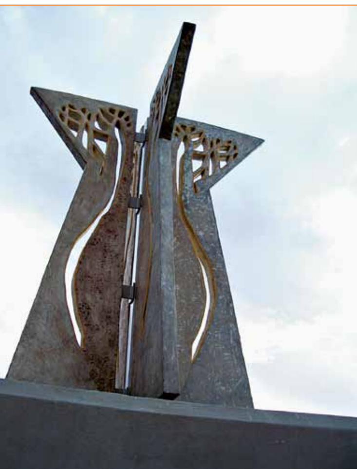
BELOW: Mitchell's Plain Public Transport Interchange is the largest transport interchange in the Western Cape, developed in consultation with the community and other stakeholders. The design, by Holm Jordaan Architects & Urban Planners, was largely informed by the pedestrian-oriented nature of the area.