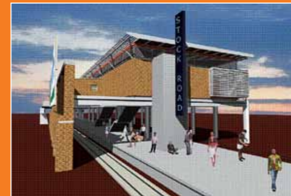
BELOW: Joe Gqabi Transport Terminus in Philippi, Cape Town.

We've selected a number of designs from "10 years = 10 buildings: Architecture in a Democratic South Africa" that do just that: buildings that make our travel and commuting experiences just that much more interesting and pleasant.