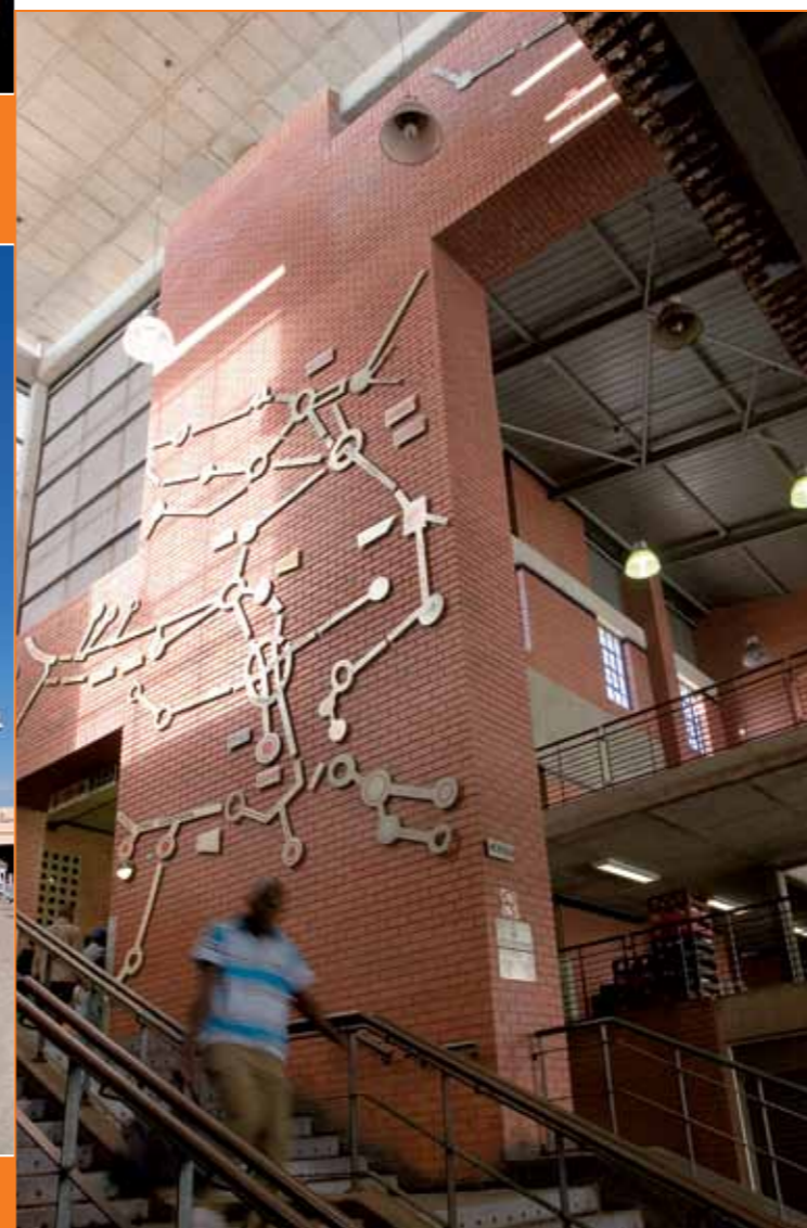
LEFT: Metro Hall Transport Facility and Traders Market, Newtown, was one of the first major infrastructural improvements of Johannesburg's new municipal dispensation. Before 1994 there were no ranking facilities for the informal taxi sector - this facility therefore forms an essential part of the city's urban renewal strategy. The design is by Urban Solutions Architects and Urban Designers.