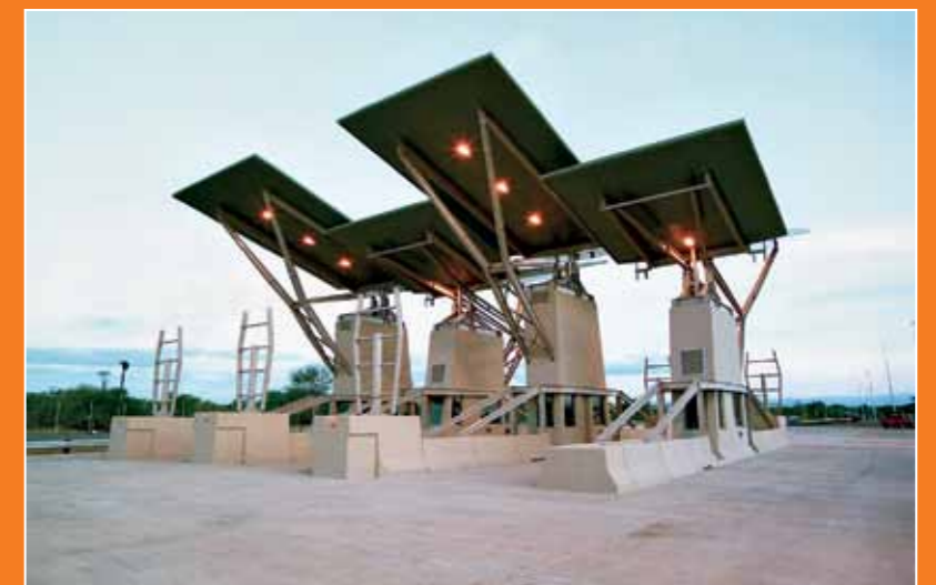
ABOVE: Baobab Toll Plaza, on the N1 Highway between Musina and Makhado, Limpopo, was designed by Mathews & Associates Architects. The architects derived conceptual inspiration from the baobab tree, which is indigenous to much of Africa, and endemic to Limpopo. It is the emblem of the province.