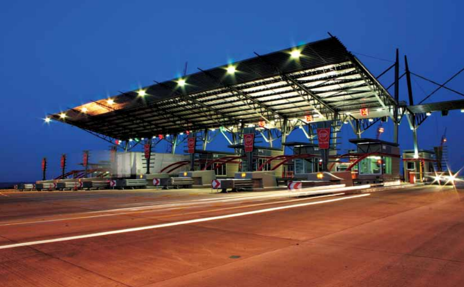
ABOVE: Diamond Hill Toll Plaza, with its traffic control facilities and eight off-ramp tollbooths, is situated on the N4 Highway between Mpumalanga and Gauteng. Mathews & Associates Architects drew on agricultural metaphors as well as the mining industry imagery for inspiration.