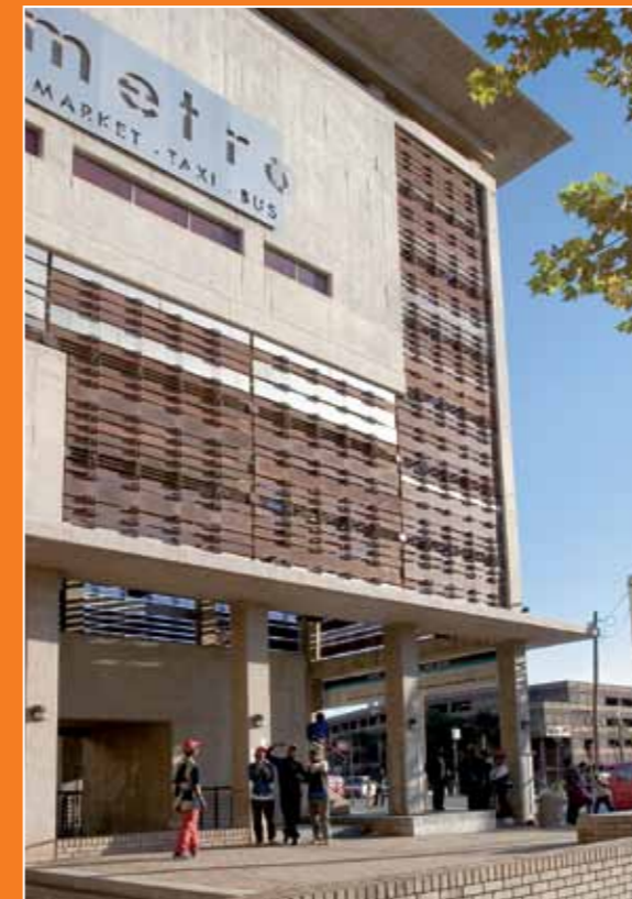
ABOVE: Metro Hall Transport Facility and Traders Market, Newtown.