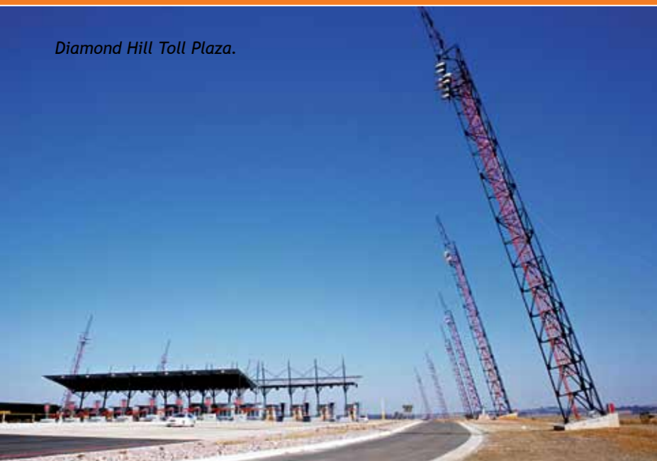
Diamond Hill Toll Plaza.