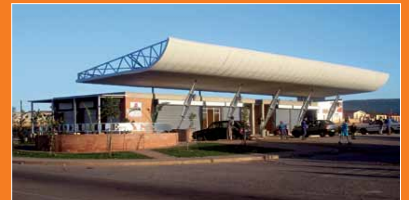
ABOVE: Kwanobuhle Carwash in Uitenhage, Eastern Cape, is a landmark in an otherwise nondescript urban landscape. Designed by Ngonyama, Okpanum and Hewitt-Coleman Architects, it is not an isolated entity like most of its petrol station counterparts, but is a vibrant node of social and communal activity.