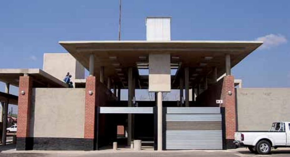
ABOVE: Baragwanath Transport Interchange and Traders Market is a kilometre-long transport node on the Old Potchefstroom Road opposite Chris Hani-Baragwanath Hospital. This formalising of the informal transport and trade is pivotal in addressing South Africa's imbalanced first-third world existence, explain the designers, Urban Solutions Architects and Urban Designers.