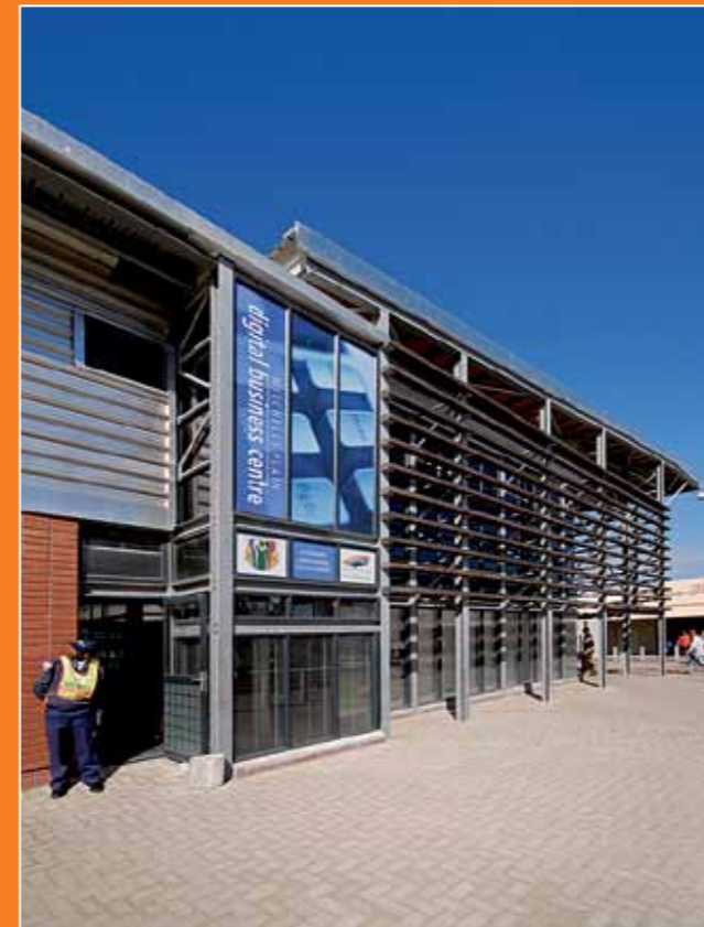
ABOVE: Mitchell's Plain Public Transport Interchange, Cape Town.